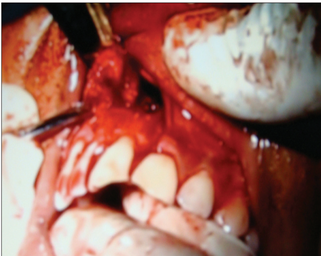
Figure 3: After separation of the periapical lesion from the surrounding bone and the nasal and palatal linings but attached to the root surface