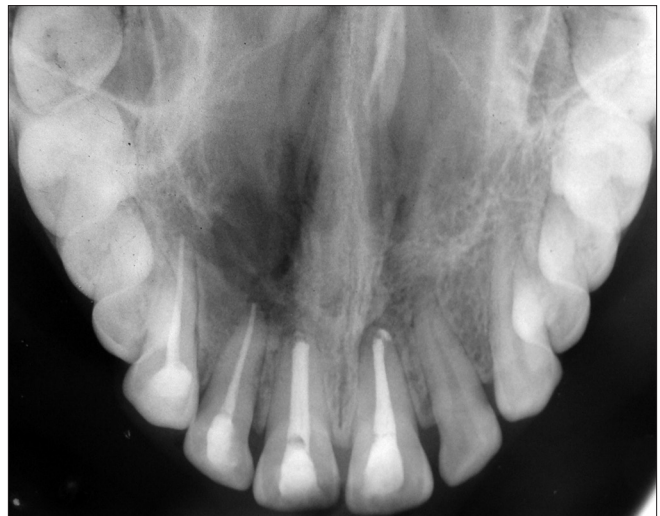
Figure 4: Radiograph at the 1½-year follow-up

The patient was free from all symptoms and signs with optimum tissue healing at the 6-month follow-up visit. Radiographic examination revealed decrease in the size of periapical radiolucency bilaterally. Tooth 21 was obturated with zinc oxide eugenol sealer and gutta-percha using lateral condensation technique. Esthetic rehabilitation of 11 and 21 was done. A radiographic review at the 1½-year follow-up showed good evidence of bone healing bilaterally [Figure 4].