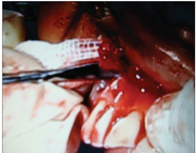
Figure 2: Sterilized gauze placed between the soft tissue mass and the lateral wall of the crypt from the distal aspect with the curette