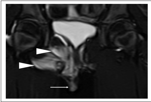
Figure 1. Short tau inversion recovery image, coronal. Diffuse high intensity of the right obturator internus and externus muscles (arrowhead) and the right labium majus (arrow) muscles by pelvic magnetic resonance imaging on hospital day 1.

was suspected, but her clinical presentation did not improve, and she was transferred to our hospital. She had no recent episodes of intensive exercise or local trauma. She had no significant medical or family history. However, she had been diagnosed with acute bronchitis 10 days earlier and had already been treated with oral administration of 12 mg/kg clarithromycin daily for 7 days.