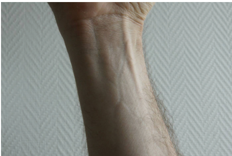
FIGURE 2: Wrist with venous furrowing or the "groove sign".

The patient received systemic corticotherapy, initially 1 g of Solumedrol intravenous for two days then reduced to 100 mg per day for one week. Treatment was then changed to oral Prednisone at 60 mg with accompanying immunosuppressive therapy (Cyclosporine 150 mg/day). Within one week, joint swelling, stiffness, oedema, and laboratory abnormalities decreased. In conjunction with the same level of Cyclosporine, the Prednisone was gradually reduced to 30 mg/day for one month, then to 10 mg/day for 3 months. At 4 months, the patient completely recovered, showing no symptoms. The oral Prednisone was reduced to 3 mg/day for the following 10 months and discontinued thereafter. In the same time, Cyclosporine was reduced to 50 mg/day for 2 months, 25 mg/day for 6 months, then discontinued. At 12 months, all laboratory tests were normal.