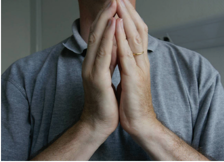
FIGURE 1: Prayer sign due to hand tenosynovitis.