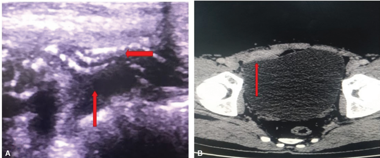
Fig. 1 (A) Ultrasound revealing thickened inflamed hypoechoic soft tissue (vertical red arrow) posterior to a linear interrupted hyperechoic structure (horizontal red arrow) representing a crumpled mesh. (B) Contrast-enhanced computed tomography of the abdomen. An axial section at the level of the urinary bladder showing well-defined linear inhomogeneous enhancing soft tissues in the anterior abdominal wall at the hernia repair site on the right side (vertical red arrow).

negative appendectomy rate of more than 20%, the most commonly used score, the Alvarado score, is not sensitive enough to diagnose acute appendicitis. Despite its inaccuracy, this score is frequently used for the clinical diagnosis of appendicitis. A negative appendectomy is thought to have occurred in 15 to 39% of patients, and research has shown that imaging is the best way to overcome this problem. 5 In addition to diagnosis, imaging can rule out other differential diagnoses. In our case, the infection was a delayed mesh infection, which is not often documented in the literature.