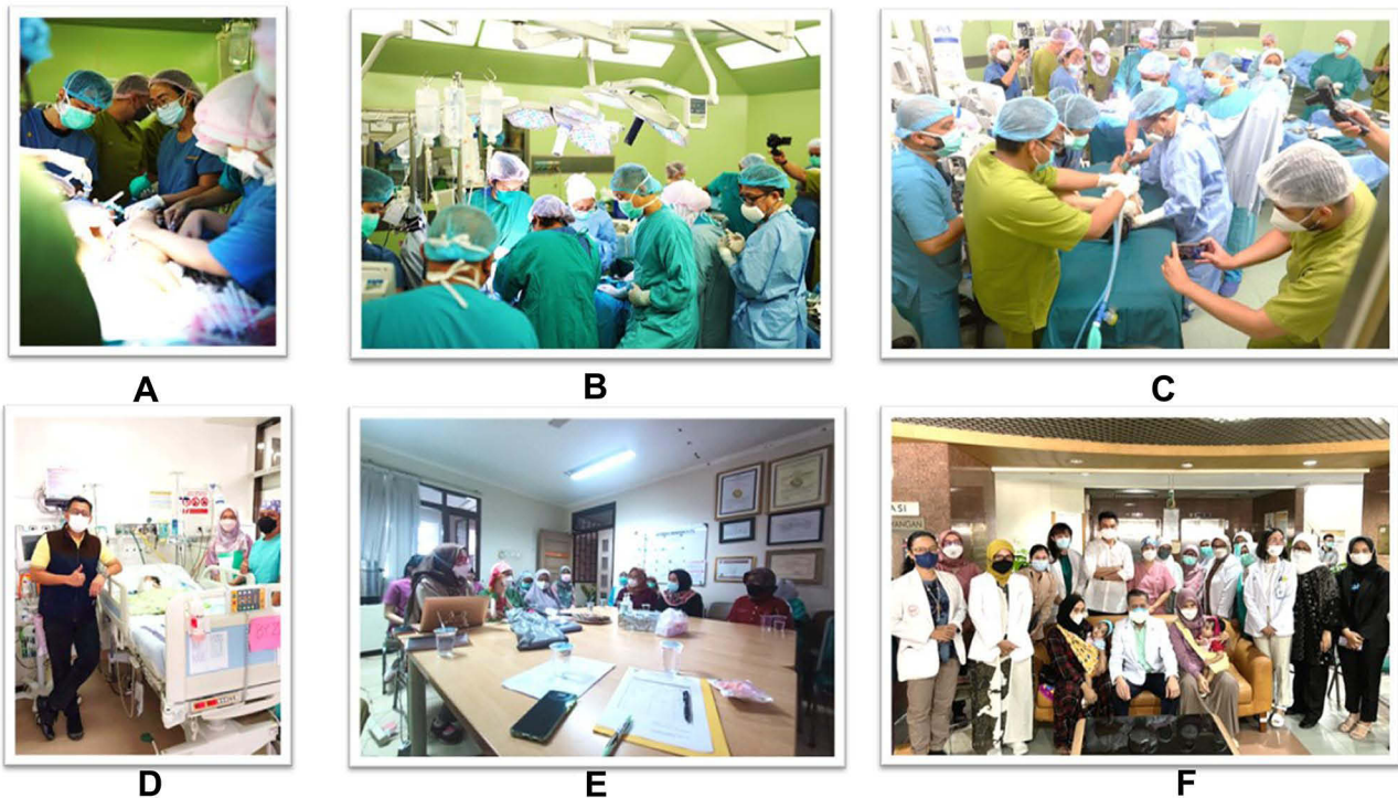
Figure 3 Conjoined Twins Separation. (A) Anesthesia induction. (B) Surgery, note that the surgical team leader (doctor with glasses) continuously supervises different surgical departments. (C) Twins separated, note that team pink and team blue (marked by colored hair caps) were focused only on one twin each. (D) Pediatric critical care. (E) Discharge meeting with parents, rehabilitation specialist, pediatrics, and social worker. (F) Discharge.

online discussion link (Zoom app; USA), where students could follow the surgery without being present in the operating room. 24 Later, both children were sent to pediatric intensive care for further treatment (Figure 3).