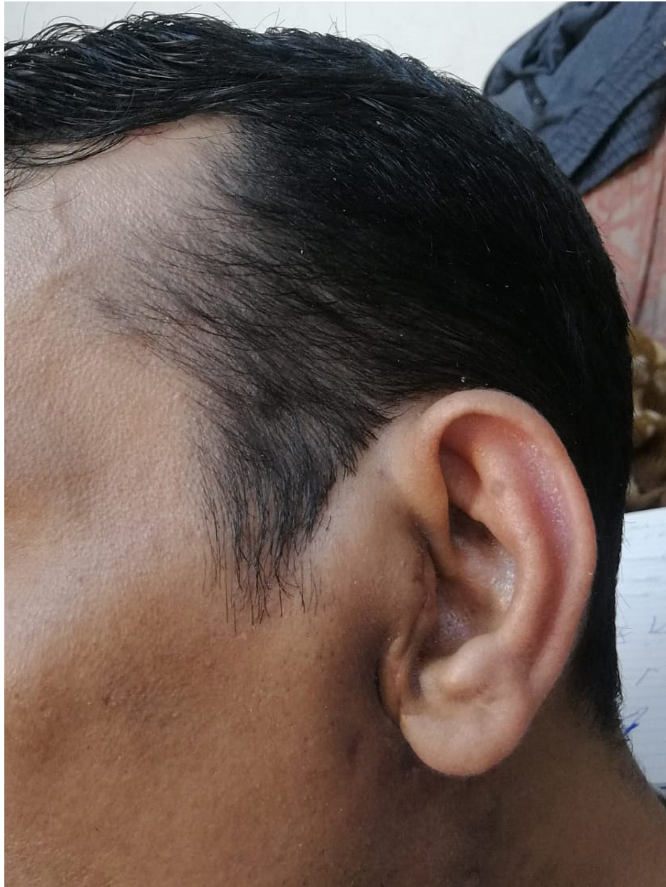
FIGURE 6: Image at the six-week follow-up showing the healed surgical site