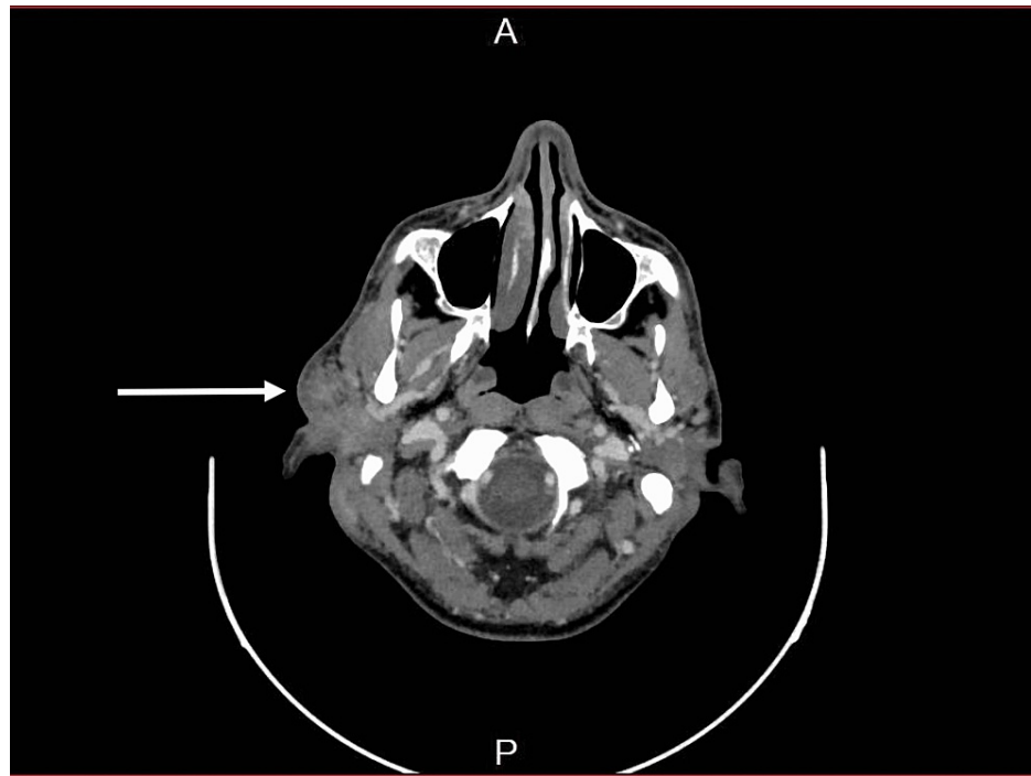
FIGURE 2: CT showing enlarged heterogeneous right parotid gland