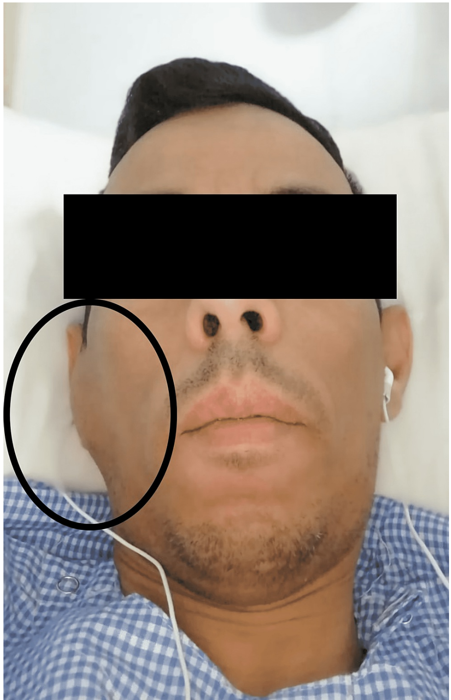
FIGURE 1: Clinical image showing enlarged right parotid gland

The patient underwent fine-needle aspiration cytology, which showed lymphoid tissue. CT scan of the head and neck showed the asymmetrical appearance of both parotid glands, as the right side appeared heterogeneous, enlarged with adjacent moderate-to-significant fat stranding (Figure 2). MRI scan of the head and neck showed moderate swelling of the superficial part of the right parotid gland associated with significantly high T2, low T1 signal intensity, and intense enhancement on the post-contrast images. Infiltration of the overlying subcutaneous tissue was noted, yet the cutaneous/skin condition appeared normal (Figures 3, 4).