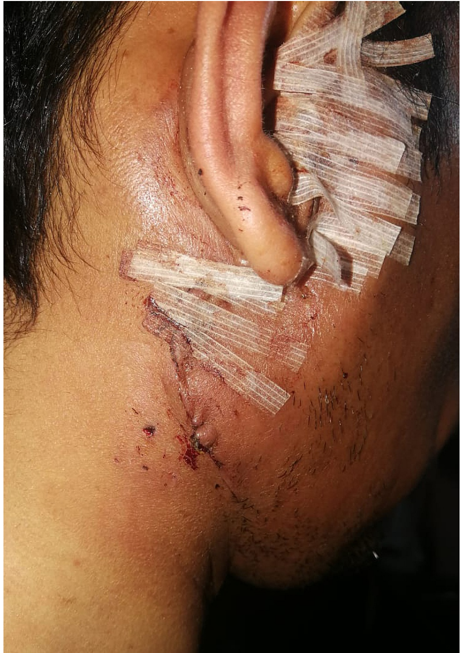
FIGURE 5: Image on the first postoperative day showing clean wound and intact facial nerve