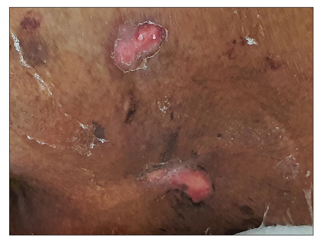
Figure 1. Stage 2 sacral ulcer without signs of an infection.