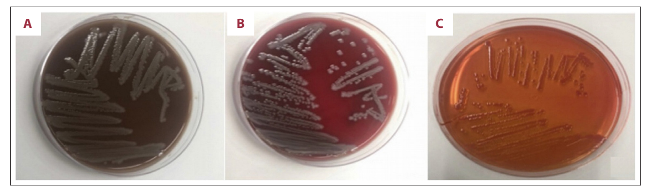
Figure 3. (A) Chocolate and (B) blood agar: mucoid, grey large colonies. (C) MacConkey agar: weak lactose fermentation.

Table 1. Antibiotics sensitivity to Leclercia adecarboxylata in the blood culture.