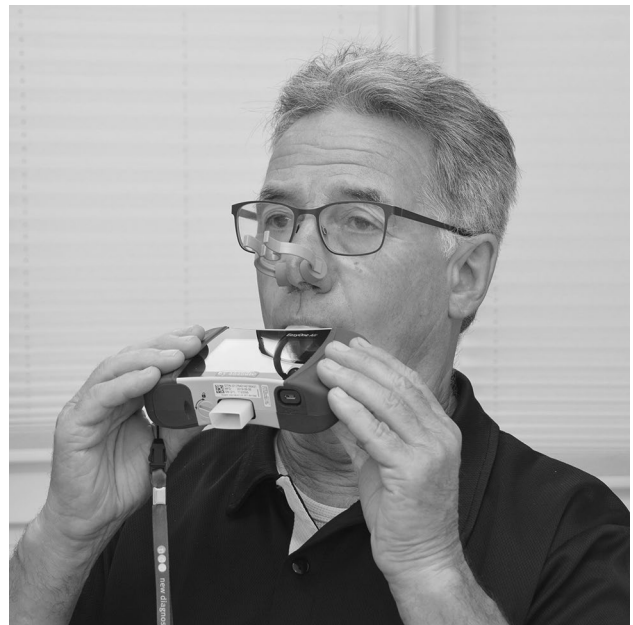
Fig. 1 Patient during voluntary peak cough flow (PCF) measurement

Reflexive cough was induced via pharyngeal exposure to aerosolized capsaicin ((6E)-N-[(4-Hydroxy-3-methoxyphenyl)methyl]-8-methylnon-6-enamide). The capsaicin