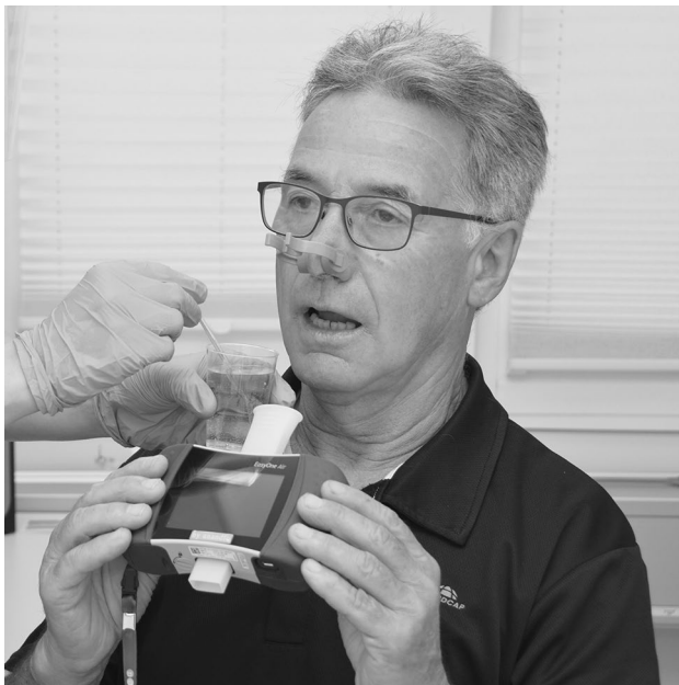
Fig. 2 Patient during reflexive peak cough flow (PCF) measurement (secondary to pharyngeal exposure to aerosolized capsaicin); test person holds transparent hard-plastic cup with capsaicin solution (liquid cayenne extract, containing 1.5–2 s% capsaicin, dissolved in 100 mL carbonated water) 2–5 cm from the patient's mouth at chin level and stirs the solution gently with a hard-plastic teaspoon

27 participants (80% power; desired effect size 0.5; alpha 0.05). SPSS® software (IBM®, Armonk, USA, version 24.0) was used for statistical analysis. Wilcoxon t test was used to compare voluntary and reflexive PCF within the groups. Comparisons between the two groups were made using Mann–Whitney U test. The significance level for all statistical tests was set at p < 0.05 . A PCF of 4.5 L/s was considered effective [34]. In addition, analysis of covariance (ANCOVA) was performed to test the influence of sex, age, height, weight, and body mass index (BMI) on voluntary and reflexive PCF.