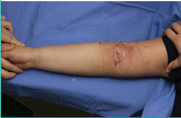
Fig. 5. Recipient site preparation (idea 2)

By 2 months post-surgery, the graft was observed to have healed completely without scar contracture, and the range of motion of the elbow joint was preserved.