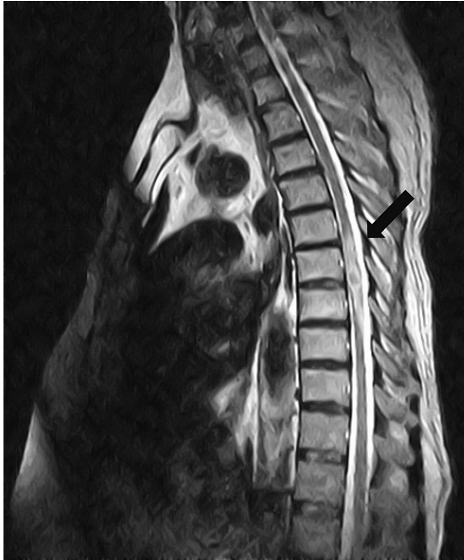
FIGURE 4: The sagittal T2-weighted thoracic MRI seen above showed a central low signal intensity lesion with a peripheral high intensity rim and surrounding edema in the cord at the T7/T8.