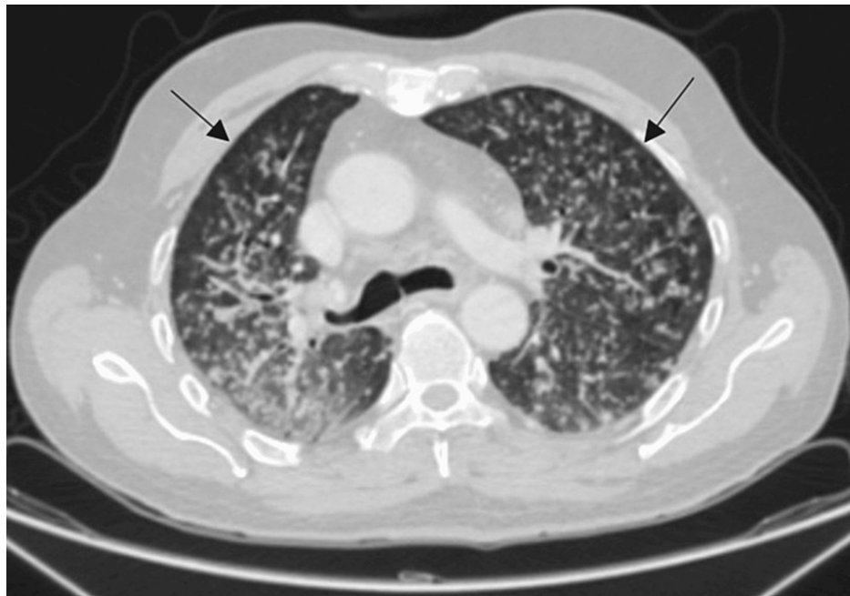
FIGURE 2: The chest CT with contrast, axial view (lung window), depicted multiple centri-lobular tree in bud nodulations.