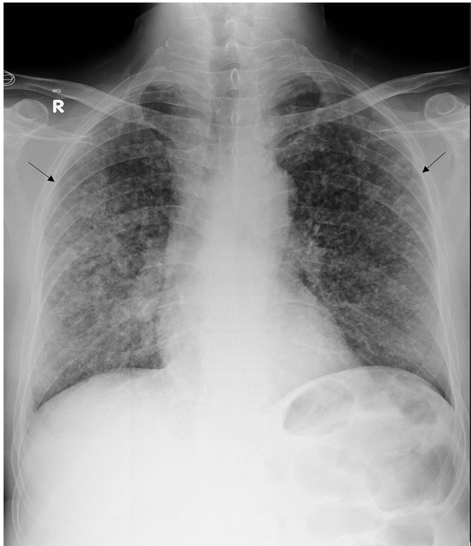
FIGURE 1: The patient's chest x-ray (PA view) showed multiple small reticulonodular nodules are seen throughout all lung lobes bilaterally.