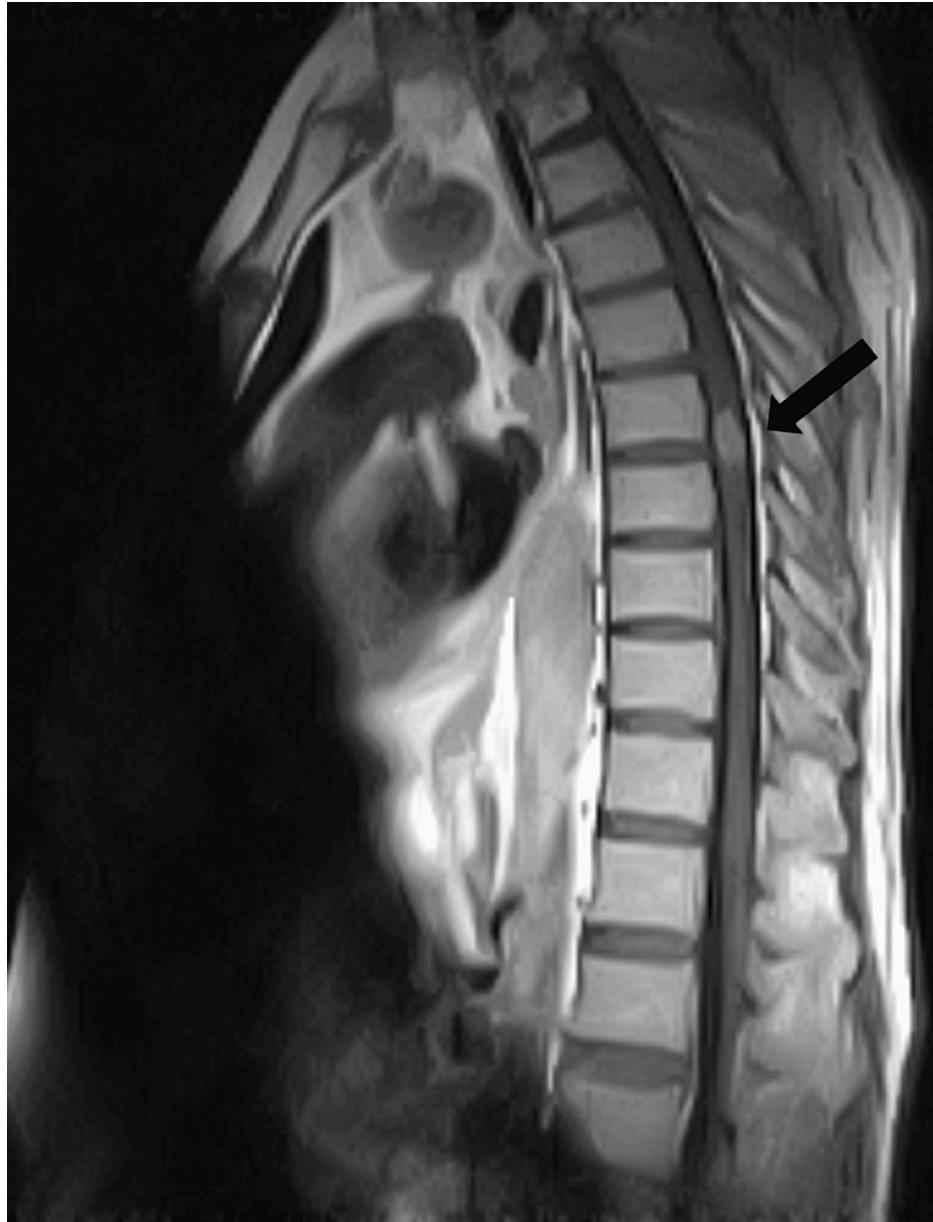
FIGURE 3: The sagittal T1-weighted post contrast thoracic MRI shown above illustrated a single enhancing lesion at T7/T8.

MRI: Magnetic Resonance Imaging, T: thoracic