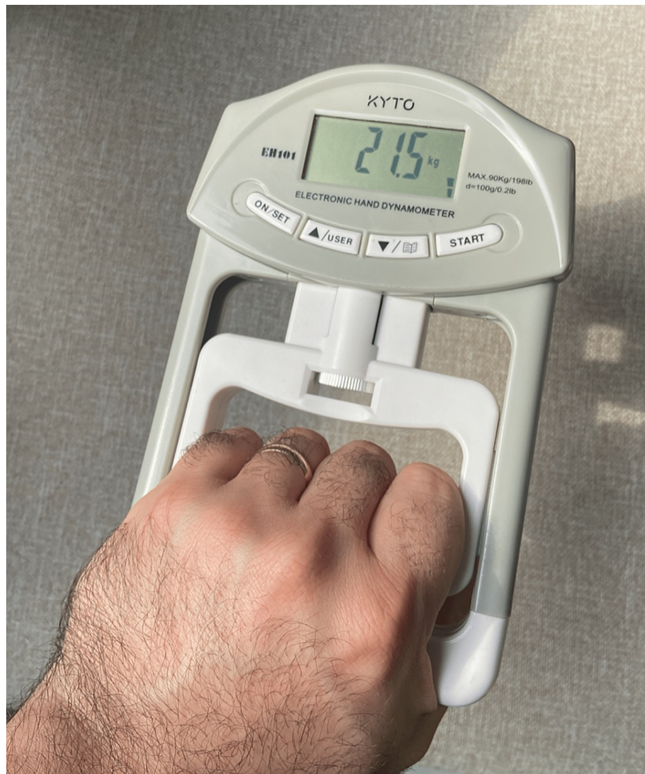
FIGURE 2: A digital hand dynamometer was used to measure hand grip strength

Demographic data were compared using an independent sample t-test and Chi-square test. Baseline scores were compared using Student's t-test. Differences in repeated measures were compared using paired sample t-test. A posthoc power analysis using G*Power 3.1 software (Düsseldorf, Germany) incorporating the mean Q-DASH scores in follow-up showed \alpha=0.05 and \beta=0.99 for 40 patients in each group.