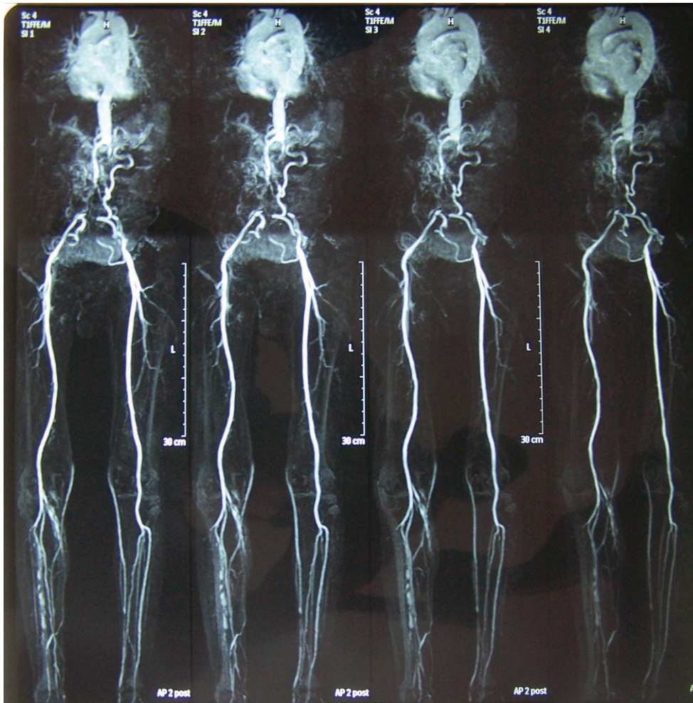
Figure 1 - Magnetic resonance angiography of the abdominal vessels, which reveals total occlusion of the abdominal aorta just below superior mesenteric artery. The lower extremities and the abdomen are perfused by means of the collateral arteries.

observed the next day; however, the renal function continued to deteriorate, with urea and creatinine levels escalating up to 298 and 8.5 mg/dl, respectively. The valsartan was withdrawn, which resulted in a decrease in urea and creatinine levels to 234 and 4.6 mg/dl, respectively. As soon as the valsartan was stopped, the patient's blood pressure again increased up to 200/110 mmHg, despite conventional anti-hypertensive treatment without ACE blockade.