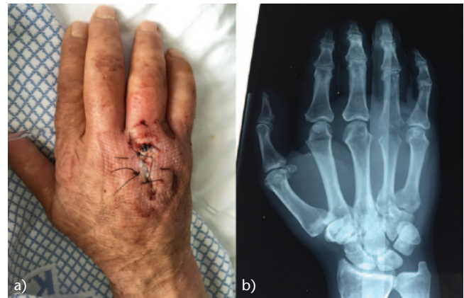
Fig. 6 (a) Clinical photograph and (b) radiograph of the hand show septic arthritis of the fourth metacarpophalangeal joint after trauma.

A felon is a closed-space infection that affects the distal finger pulp; Staphylococcus aureus is the most common bacterial isolate. 1,4 At the distal phalanx, a closed space is created by multiple vertical fibrous septa that originate from the periosteum of the distal phalanx and attach to the skin creating a closed space of connective tissue. 1,43 An abscess can easily develop after inoculation in the pulp; however, most patients present after abscess formation and surgical drainage is required (Fig. 4). 1,4,38,44,45 Differential diagnosis should include herpes simplex virus infection 10,46 in which surgical drainage is not recommended. 1,4,10,46,47