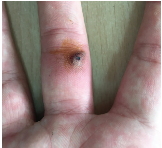
Fig. 9 Granuloma formation after a foreign body at the middle finger.

Although most hand infections are caused by common skin bacteria, hand surgeons should be aware of the possibility of infections caused by less usual microorganisms. These include mycobacteria, viruses or fungi. Such infections will not respond to broad-spectrum antibiotics and are especially common in immunocompromised