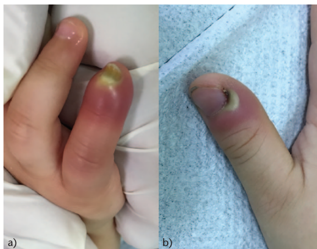
Fig. 3 Acute paronychia requiring drainage in (a) a child and (b) an adult.

Dog bite wounds (Fig. 2) are more common than cat bite wounds. Both are more commonly associated with Pasteurella species and other aerobic bacteria such as Streptococci , Moraxella and Neisseria . Anaerobic bacteria such as Fusobacterium , Bacteriodes , Porphyromonas and