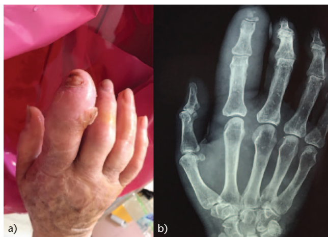
Fig. 7 (a) Clinical photograph and (b) radiograph of the hand show osteomyelitis of the distal phalanx of the index in a patient with diabetes mellitus.

Patients usually present with a swollen, erythematous and painful joint, often with an obvious adjacent penetrating trauma. 1,4,66 When trauma is not evident, the differential diagnosis should include degenerative arthritis, inflammatory arthritis, crystalline arthropathy, cellulitis and soft tissue abscess. 67