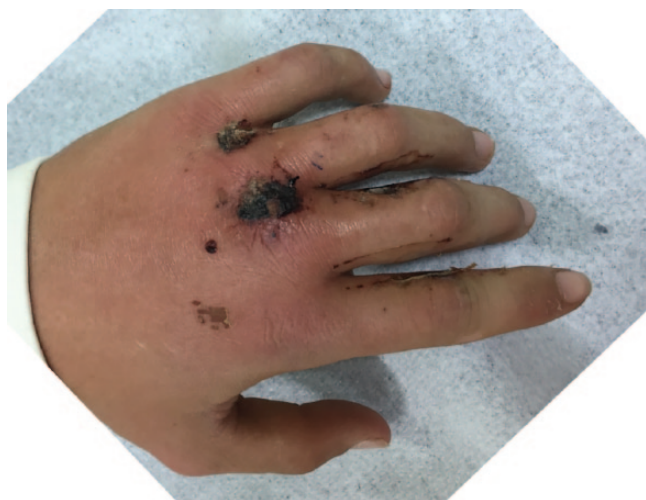
Fig. 1 Clenched fist bite wound at the dorsum of the hand after a fight injury.