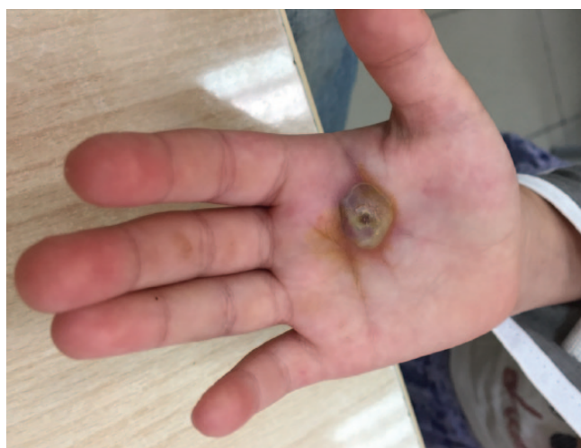
Fig. 2 Infected dog bite wound at the palm.

(Fig. 1) and the true bite injuries. 1,30 Clenched fist injuries might seem simple at presentation and usually can be misleading. Occult clenched fist injuries may include a traumatic arthrotomy, open metacarpal fracture, or an underlying broken tooth part. 1,6,13,30,31 Any patient with an open wound at the knuckles should be carefully examined with the hand in the position that the injury occurred because, due to the mobility of the skin on the dorsal aspect of the hand, the exact position of a deeper injury might be missed. 30