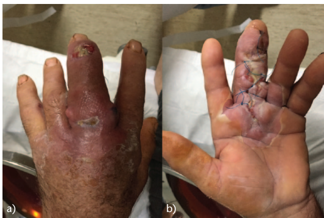
Fig. 5 (a) Dorsal and (b) palmar views of the hand show flexor tenosynovitis of the middle finger treated with open surgical drainage and debridement.

occurs after disruption of the barrier formed by the eponychium and the nail vest. Individuals with high exposure to moisture and/or chemical irritants and patients with diabetes mellitus and immunosuppression are at higher risk of developing chronic paronychia. 1,4,37,41,42