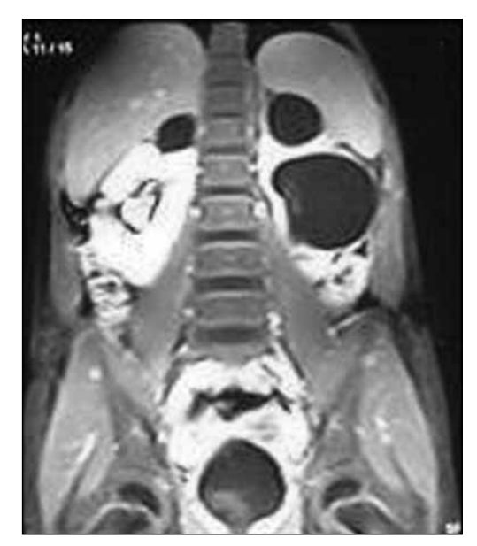
Figure 2: Contrast enhanced T1 weighted image showing normally functioning right lower moity

It is obvious that conventional radiology cannot singly