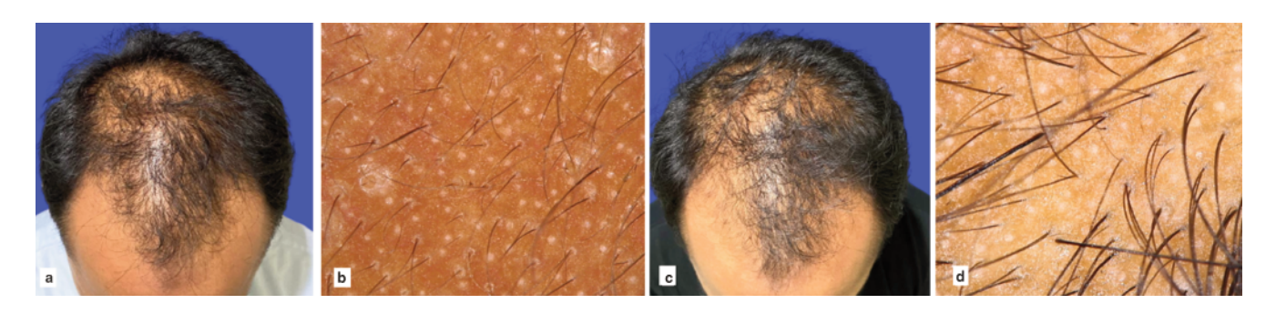
Figure 3. Clinical comparison of minoxidil therapy. a) Week 0; b) trichoscale at week 0; c) week 12; d) trichoscale at week 12.