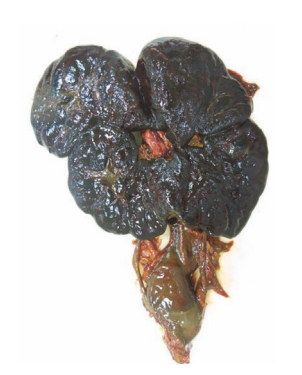
FIGURE 1: Photograph showing a horse shoe kidney.

were noted: hypertelorism, low set ears, short philtrum, high arched palate, short neck, nuchal edema, and widely spaced nipples. Transient thrombocytopenia was noted during the first week of life; the lowest platelet count was 62,000/\text{mm}^3 . Leukocytosis ( 32-45 \times 10^9/\text{L} ), monocytosis (8-28%), and blasts (2%) were noted throughout his 76 days of hospitalization. He had feeding difficulties (poor suck) and gastrointestinal symptoms (vomiting, abdominal distension) requiring gavage feeding since the first week of life. A contrast upper GI and small bowel follow-through study at 3 weeks of age showed delayed gastric emptying and pylorospasm. The baby did not thrive despite feeding with high calorie formula/breast milk. Abdominal and renal ultrasound showed a horseshoe kidney and a small splenic cyst ( 5 \times 4 mm).