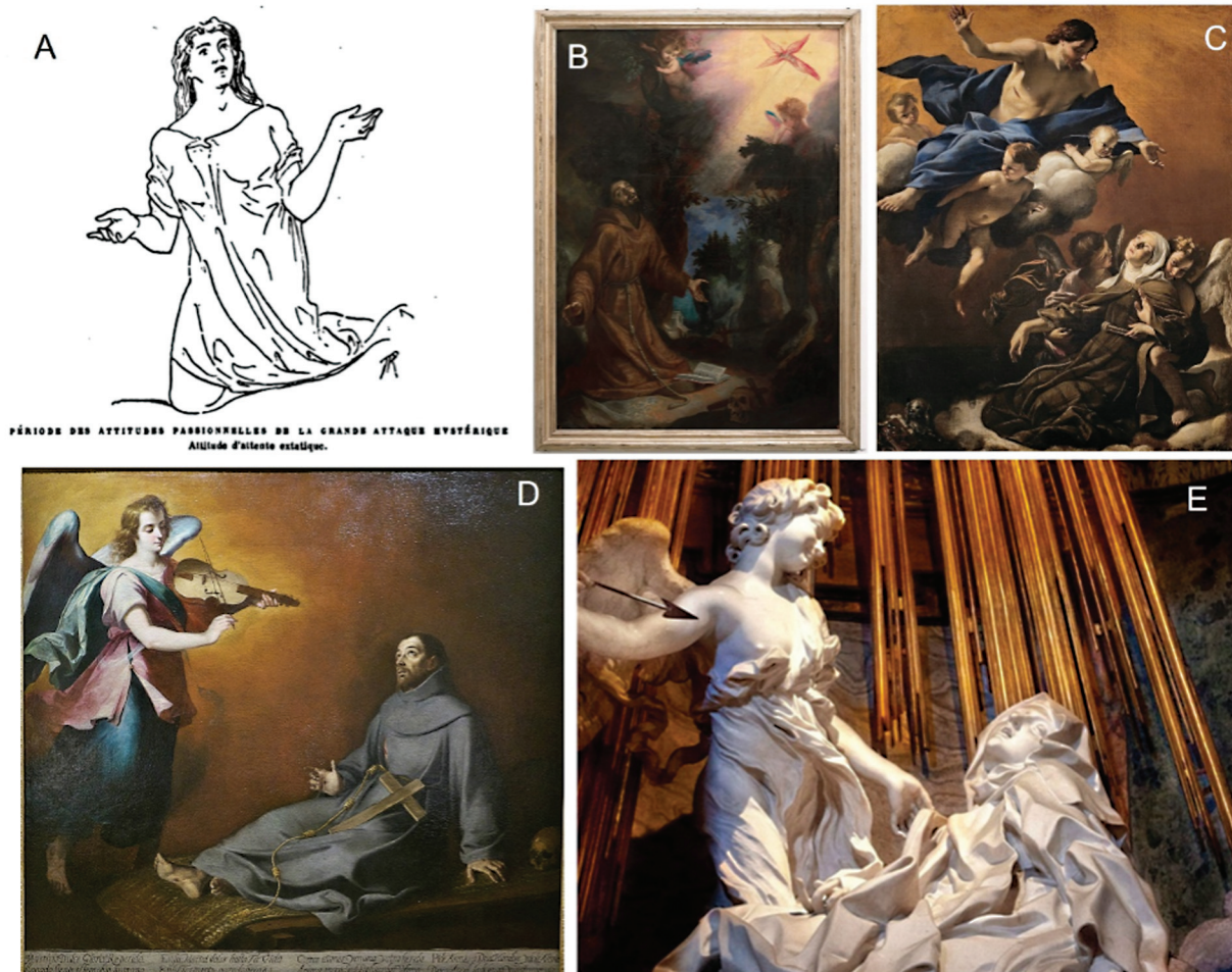
Figure 2 (A) Sainte Catherine de Sienne en extase. (B) Saint Francis receives the stigmata, by Cigoli. (C) Ecstasy of Saint Margaret of Cortona, by Giovanni Lanfranco. (D) The ecstasy of Saint Francis of Assisi, by Bartolomé Esteban Murillo. (E) The ecstasy of Saint Teresa, by Gian Lorenzo Bernini.

A lacking honorable mention is Gian Lorenzo Bernini's sculpture "The Ecstasy of Saint Teresa" (► Figure 2E ), the prototypical representation of an ecstatic posture. Years