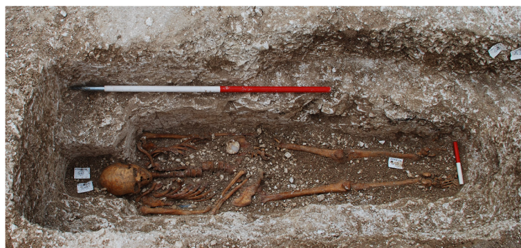
Figure 1 The burial of Sk27 showing the associated scallop shell.

Sanger sequencing of targeted SNPs (Table 2) was in agreement with Illumina sequencing so validating both typing and sequencing methods. Analysis of VNTR genotypes was not possible for either Sk14 or Sk27 as insufficient numbers of reads spanned the ML0058c (21–3) region,