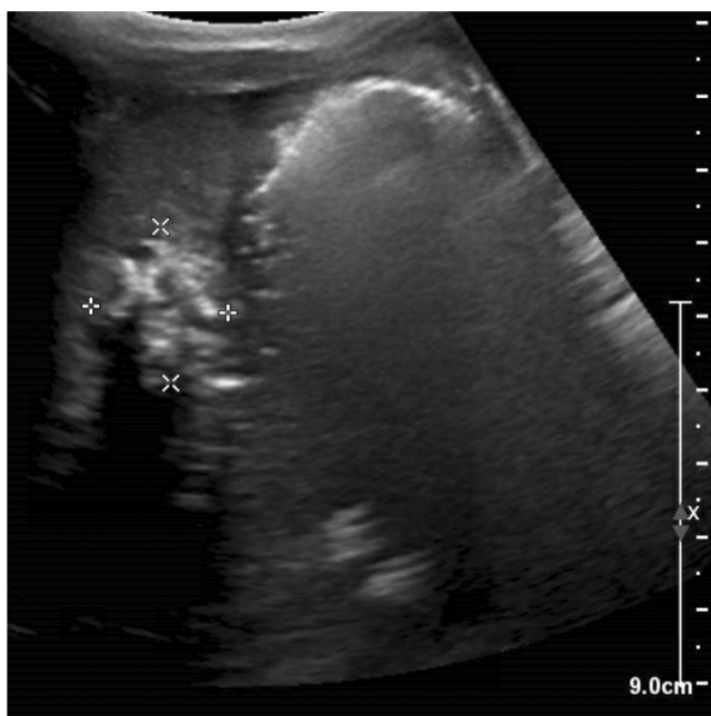
FIGURE 1 Abdominal US showing a 34 × 22 × 25 mm mass between segments II and III

We managed our patient with a conservative treatment and did not proceed to any surgical intervention. The patient benefited from close follow-up. Her hemangioma progressively regressed on serial imaging. Indeed, it measured only half of its initial size 2 months after hospitalization at the age of 4 months. However, at that time, ascites amount increased again needing a second short hospitalization. Drainage of ascites was not possible and it spontaneously regressed again without increasing diuretics. The patient also developed anemia (lowest hemoglobin of 7 g/dl) requiring folic acid and iron supplementation without any evidence of consumptive coagulopathy. After this episode, the evolution of the patient was favorable and the diuretics could be gradually reduced. At the age of 6 months, 4 months after her first hospitalization, ascites disappeared completely.