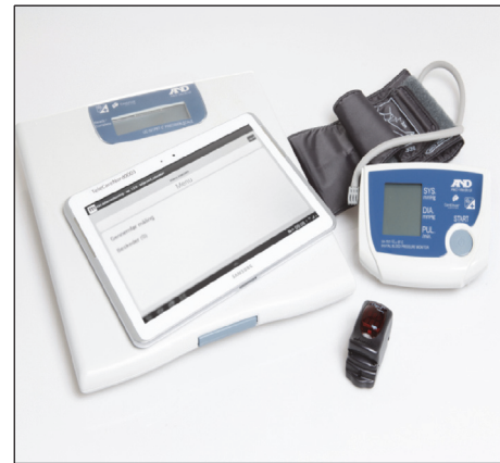
FIGURE 1: The Telekit system from the Danish TeleCare North trial. The COPD patients use Telekit to measure their vital signs.

the patients' answers to disease-related questions. In the light of this information, the healthcare providers can respond quickly and get the patients started on proper treatments [4]. Figure 1 shows the equipment that makes up the Telekit system.