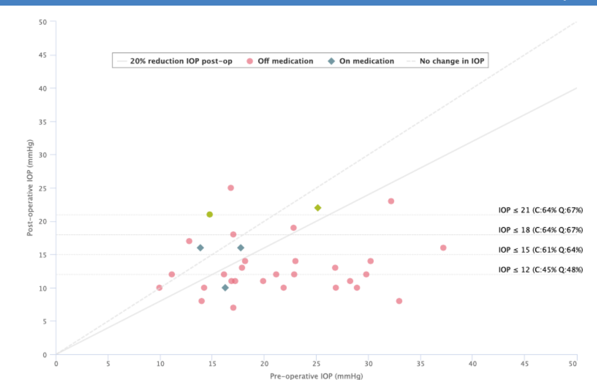
Figure 2 Example of FGB personalised surgical report for a given procedure providing scatterplot outcomes and complete and qualified success. FGB, Fight Glaucoma Blindness!; IOP, intraocular pressure.

FGB now contains 5946 procedure events, the most common of which are shown in figure 2. Total numbers of the most common individual procedures are summarised in online supplemental table 2. While the most common procedure is cataract surgery, most of these surgeries were in combination with an angle-based MIGS device. Other cataract surgeries occurred during follow-up of other procedures, for example, a patient who required cataract surgery in the months-years following trabeculectomy.