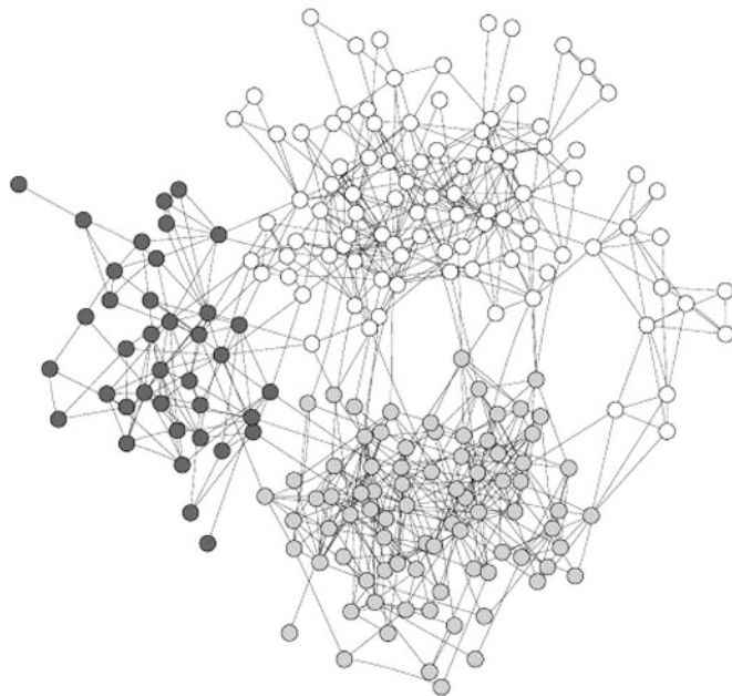
Figure 1 Friendship clusters in a US school. Reprinted with permission from Moody J. Peer influence groups: identifying dense clusters in large networks. Soc Netw 2001;23:261–83.

Nodes in a network might be thought to be randomly related, each with a similar number of connections. However, most networks are actually “scale-free,” with unequally distributed nodes with varying numbers of connections. 34–36 A few nodes with many connections form “hubs” which emerge naturally and become the distributed force field of the network (for example, the Google search engine, King’s Cross station or a prominent, influential clinician). Scale-free networks are less likely to become congested because they concentrate effort efficiently. 37 The internet has such a structure, with a limited