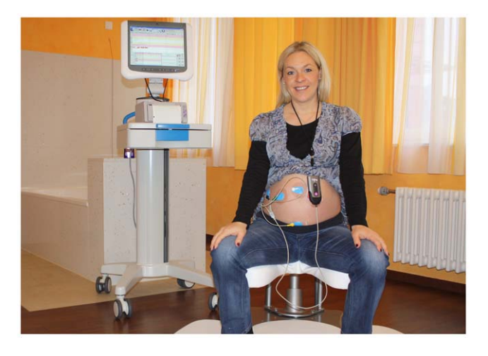
Figure 1. Fetal ECG monitoring device (MONICA AN24). Portable transabdominal fetal ECG monitoring device with 5 electrodes attached to the maternal abdomen. doi:10.1371/journal.pone.0028129.g001

information to be stored in the hospital database and used for research by the responsible individuals.