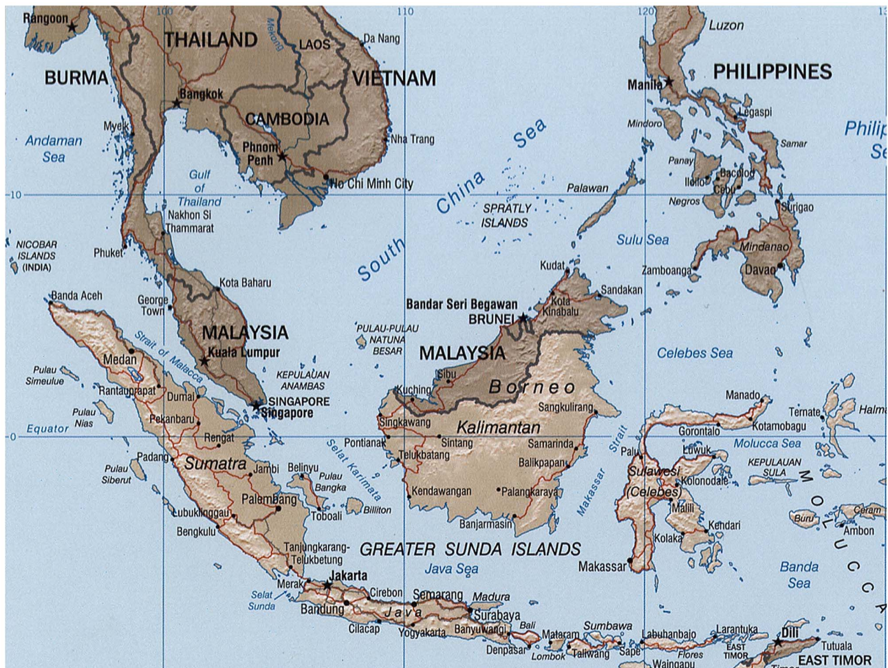
Figure 1. Map of Indonesia. From Wikimedia Commons. Available: http://commons.wikimedia.org/wiki/File:Indonesia_2002_CIA_map.png . Accessed 6 June 2013. doi:10.1371/journal.pntd.0002449.g001