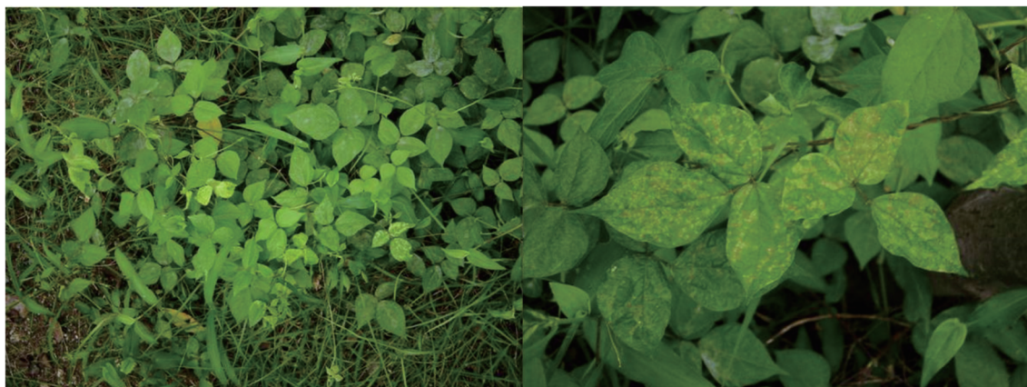
Fig. 1. Natural symptoms on Vigna angularis var. nipponensis in field infected with Cucumber mosaic virus (CMV) isolate wVa. Chlorotic spots, mosaic, and leaf yellowing were observed.

To compare the infectivity of CMV-wVa isolate with CMV isolates of various host, CMV-Z(zucchini), -RB(cone flower), -ZM(maize), -Pa(azuki bean), and CM-19(azuki bean) (Choi et al., 1998; Kim et al., 2010a, 2010b, 2011 and Iizuka et al., 1990) along with CMV-wVa were inoculated onto 6 different plant species belonging to Fabaceae .