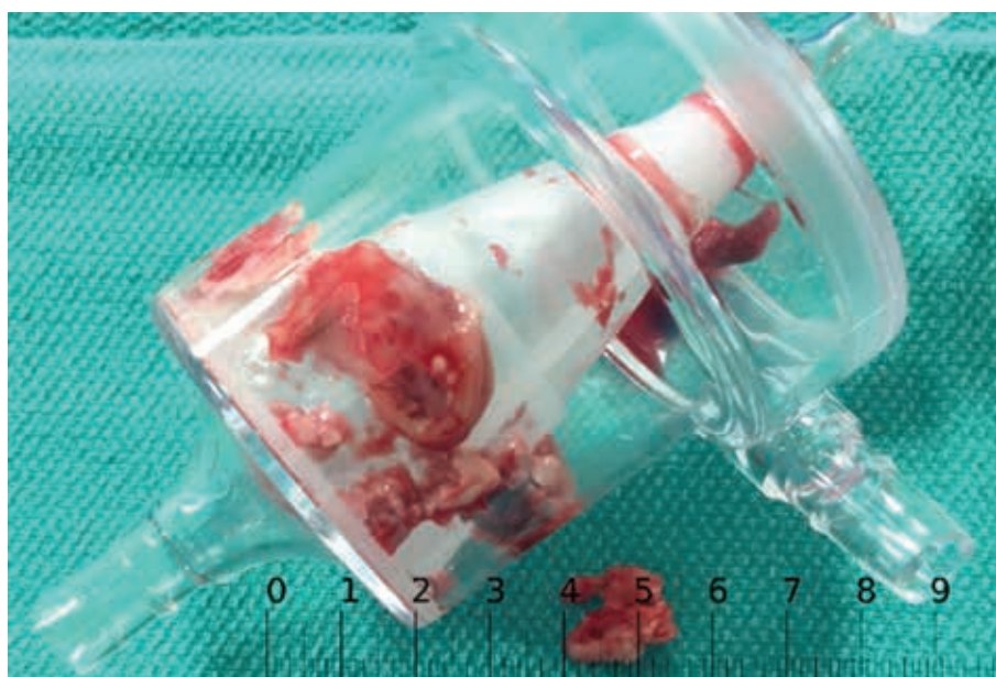
Figure 2: Vegetation material extracted into the AngioVac filter (AngioDynamics Inc., Latham, NY, USA) in case 1.

A 45-year-old female with heart failure, cardiomyopathy, and a dual-chamber ICD presented with acute-on-chronic respiratory failure secondary to a right lower lobe subsegmental pulmonary embolism. Blood cultures were positive for Enterobacter faecalis . Infective endocarditis was confirmed by a TEE scan, which demonstrated a 3.9 cm × 1.3 cm echodensity on the posterior leaflet of the tricuspid valve as well as a vegetation on the