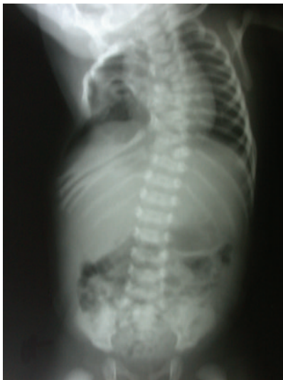
FIGURE 2: Abdomin thoracic AP view showing multiple vertebral bodies defects involving the thoracic spine with related rib abnormalities.

clinical picture. Yet, there has been still controversy about the nosologic delineation and the genetic basis of this complex topic in the literature.