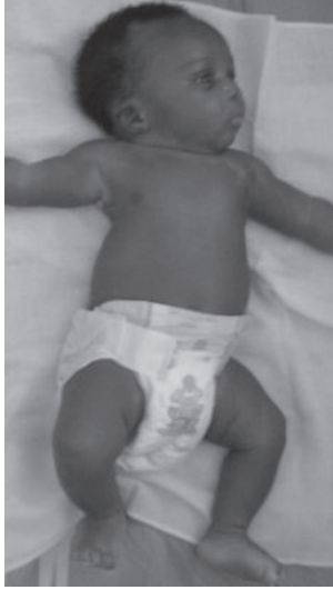
FIGURE 1: Clinical aspect showing the right-sided basithoracic excavation with the result of an asymmetrical chest-wall deformity.