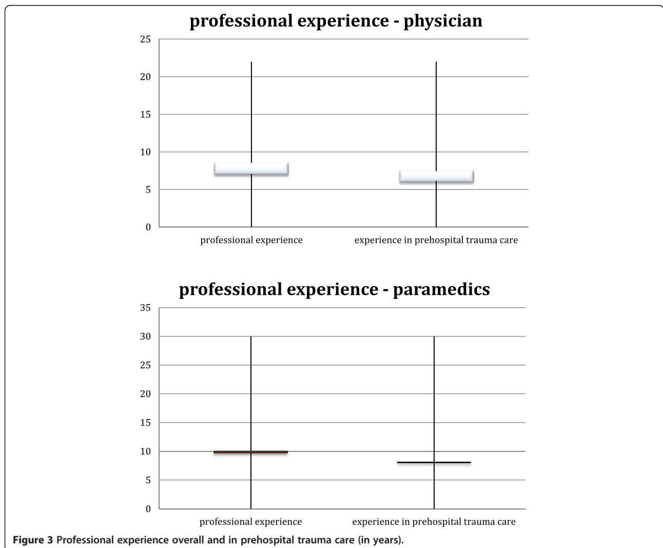
Figure 3 Professional experience overall and in prehospital trauma care (in years).

An interesting result, which is illustrated on the visual analogue scale, was that participants' self-assessment with respect to confidence and assurance in the prehospital trauma situations was lower in retrospect than it had been prior to their course participation ( p < 0.001 ). After the course confidence etc. increased remarkably and reached higher rates than before the course ( p < 0.001 ). After PHTLS both groups showed similar ratings concerning the course concept indicating that PHTLS could equalize some training deficits and help to gain confidence and assurance in prehospital trauma situations. Participants were convinced by PHTLS and 90% of the paramedics compared to 100% of the physicians would recommend PHTLS to colleagues. Still anesthetists were skeptical in regard to the importance of PHTLS for their personal situation. 3 out of 5