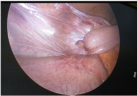
Fig. 3. Hernial sac containing small bowel entering through the inferior ileocecal recess.