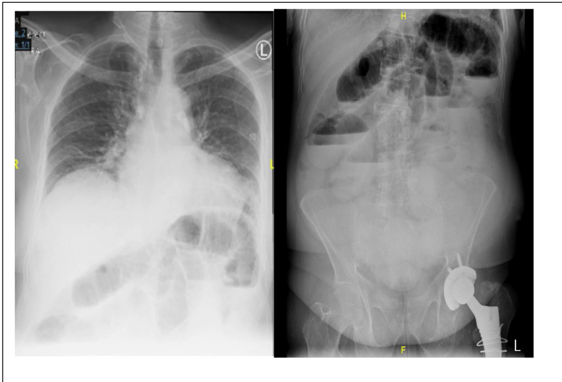
Fig. 1. Chest and abdomen radiographs reveal dilated bowel and multiple air–fluid levels; there is no air under the diaphragm.