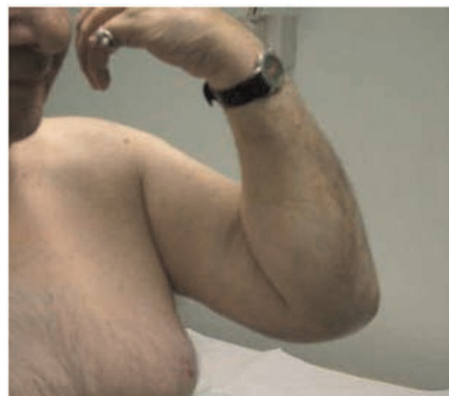
Figure 3. Elbow flexion 150°.

potentially could have limited the rehabilitation potential as well as the range of movement that has previously been established. Thus, using screws secured in a miss-a-nail technique, which has been described in the management of femoral fractures [6,7], and the use of the medial and lateral Mayo plates around the humeral intramedullary nail in situ achieved stability of the periprosthetic fracture.