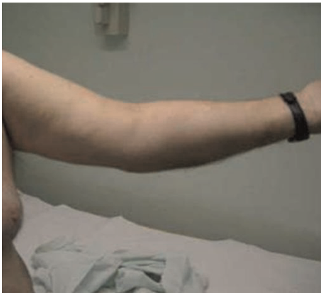
Figure 4. Elbow extension 15°.

This technique proved to be a successful option with a very good outcome both surgically and functionally for the patient.