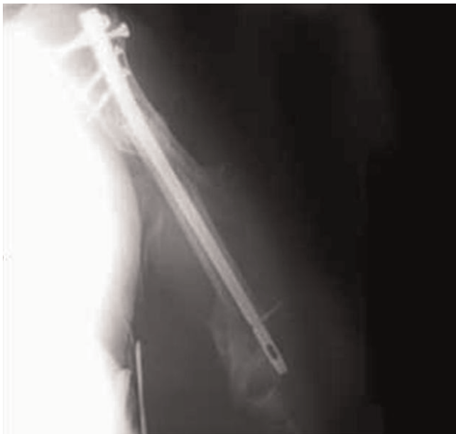
Figure 1. AP radiograph of the periprosthetic fracture of left humerus.