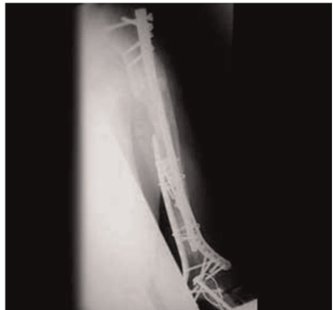
Figure 6. Lateral radiograph of left elbow post fixation with elbow in full extension.

satisfactory results. Leaving the original prosthesis in place and using a miss-a-nail technique with medial and lateral plates around the prosthesis is a good method to secure the fracture with the minimum perioperative trauma to the patient and can achieve a good functional outcome.