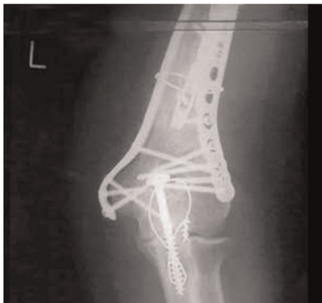
Figure 5. AP radiograph of left elbow post fixation.

Distal humeral fractures associated with previous prosthetic nail present a challenge to the surgeon to obtain