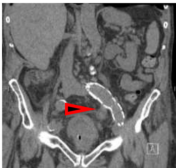
Figure 2 Abdominal CT scan showing the left femoro-popliteal graft and surrounding collection. (See arrow).

There were no concurrent neurological symptoms or any history of underlying immunosuppression. He underwent a surgical incision and drainage of the perianal abscess which revealed positive microbiological culture of Listeria monocytogenes and mixed bowel flora. The MIC of penicillin against this organism tested by Etest was 0.5 mg/L. A brain CT did not demonstrate the presence of any cerebral abscesses. The patient received a 10 day course of oral ampicillin (1 gram/TDS) and ciprofloxacin (500 mg/BD).