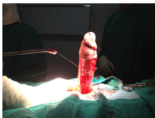
Figure 2 An intraoperative view showing the penis becoming straight during plication.

Lue [6], after an injection with 60 mg papaverine into the corpus cavernosum. A subcoronal circumcising incision was made, and then the centre of curvature was marked using a marking pen. Entry and exit points of the suture were also marked. Plication sutures were then placed through the full thickness of the tunica albuginea. Sutures were tied once the straightness of the penis was confirmed by all the surgical team (Fig. 2). The dartos fascia was then re-approximated and the skin was closed [6]. A Coban dressing was applied after surgery for 48 h. Patients were discharged on the same day, and instructed not to attempt sexual intercourse during the first 4 weeks after surgery. They were also advised to apply ice-packs whenever they had painful nocturnal erections. Patients were followed up for 3 months, and then patients and their female partner were asked to complete a specific questionnaire separately, to evaluate the outcome of the procedure and patient/partner satisfaction (Appendix).