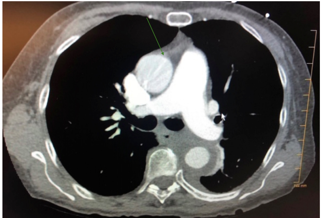
FIGURE 2: Aortic dissection with extravasation

CT scan of the chest with intravenous contrast showing aortic dissection with extravasation.