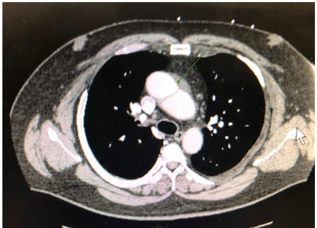
FIGURE 1: Ascending aorta dissection

Since CXR only provides suggestive findings and lacks abdominal visualization, computed tomography angiography (CTA) is the imaging of choice for BTAI, with a reported sensitivity of 98% and specificity of nearly 100% [3]. CTA imaging findings are divided as suggestive and definitive signs for traumatic aortic injury. Suggestive signs are mediastinal or peri-aortic hematoma, retro-crural hematoma, and small caliber of the aorta distal to the injury. Definitive signs are aortic dissection (Figure 1), contained rupture, intramural thrombus, active contrast extravasation (Figure 2), and abnormalities of aortic contour [3].