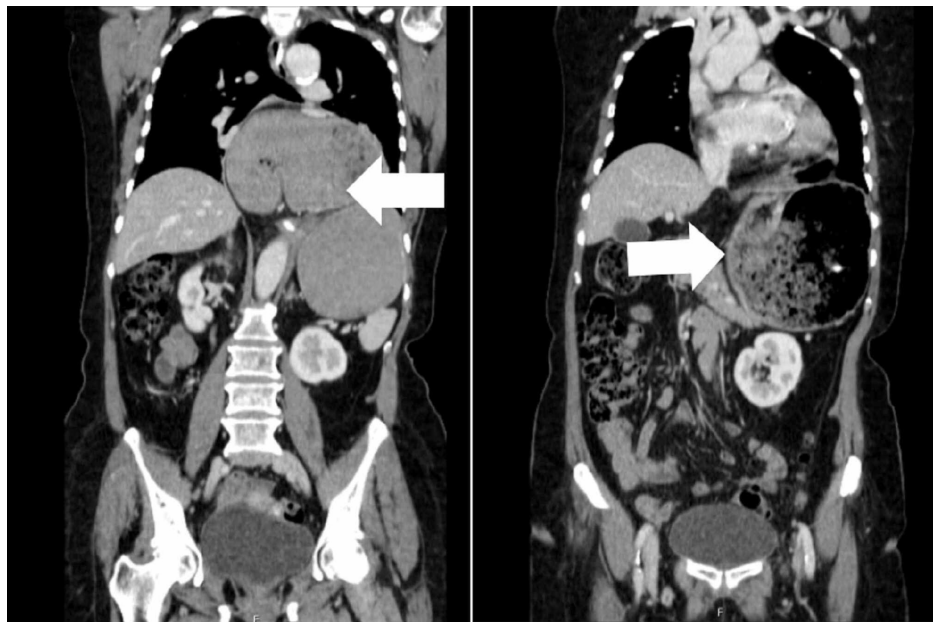
FIGURE 2: Abdomino-Pelvic tomography showing a markedly distended stomach (white arrow)

In the abdomino-pelvic tomography a markedly distended stomach was observed in a retrocardiac location, showing the gastric antrum in the posterior mediastinum. Concomitantly, the gastric walls were distended and hypodense, and there were signs of air in liver parenchyma suggestive of a mesenteroaxial gastric volvulus (Figure 2).