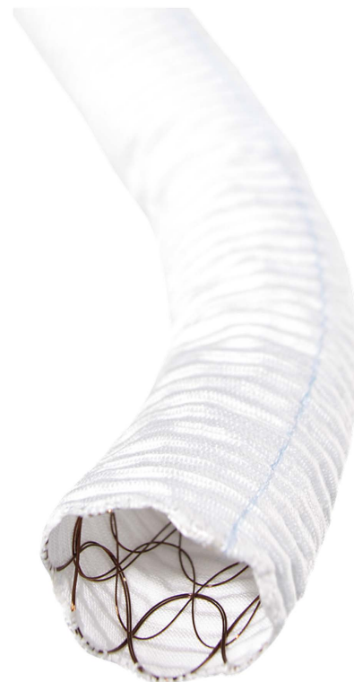
Fig. 1 J graft open stent graft.