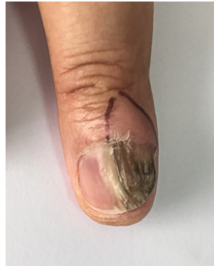
Figure 1. Onychomatricoma. Clinical image. Lateral, hyperkeratotic nail thickening, with increased transverse curvature. Highlights an intense pigmentation of the nail plaque.

We present the case of a 62-year-old male patient with a history of non-Hodgkin lymphoma treated six years ago and a melanoma in a first-degree relative. He presented a 2-year history of progressive deformation of the nail plate in the middle finger of the left hand, with thickening, discoloration, and hyperpigmentation. He had previously received empirical treatment with oral terbinafine for two months, without improvement. On physical examination, he presented a hard, thickened, highly hyperpigmented nail plate, with lateral deformation and hyperkeratosis, affecting from the nail matrix to the distal free edge of the nail plate (Fig. 1). Direct microscopic examination and fungal culture were negative for fungal infection. Ultrasonographic analysis (8 to 18 MHz multi-frequency linear compact transducer, General Electric Logic E9 XD Clear, General Electric Health Systems, Waukesha; WI), showed a subungual solid hypoechoic structure (1.5 cm x 0.8 cm x 0.5 cm) with hyperechoic lines that involved the proximal segment of the nail bed, including the ulnar wing of the nail matrix, and protruded into the interplate space. Thickening and upward of the nail plate