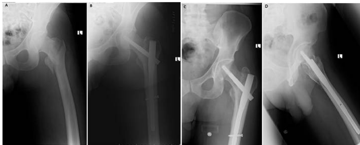
Figure 1. Type A2 fracture (A). Immediate postoperative AP radiograph showing a neck-shaft angle of 130^\circ (B). The 6 months follow up AP radiograph showing a neck-shaft angle of 130^\circ and union of the fracture (C). Lateral view at 6 months follow up (D).

At final follow-up, neck shaft angle was maintained above 120^\circ in 44 (88%) patients and only six (12%) patients developed secondary varus collapse (neck-shaft angle < 120^\circ ) (Figures 1 and 2). The average HHS was 79.3 points. Harris Hip Scores was excellent in 9 (18%) patients, good/fair in 32 (64%) patients and poor in 9 patients (18%).