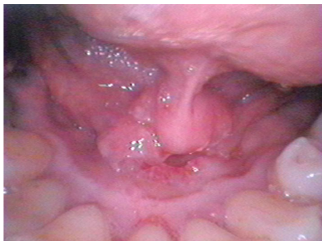
FIGURE 1 The image of the oral floor tumor. The patient presented with a 15 × 10 mm rough mass with an ulcer, erythema, and induration on the left oral floor

II), and a free forearm flap transplantation were carried out in December 2014. The margins of the excised tumor were tumor-free. The final clinical staging was pT1N2bM0, and there was more lymph metastasis than the previous CT revealed. Therefore, prophylactic postoperative chemoradiotherapy was chosen as a course of treatment (radiotherapy: 59.5 Gy/30 Fr and chemotherapy: Cisplatin [80 mg/m 2 ] + 5-FU [800 mg/m 2 ] × 2 times).