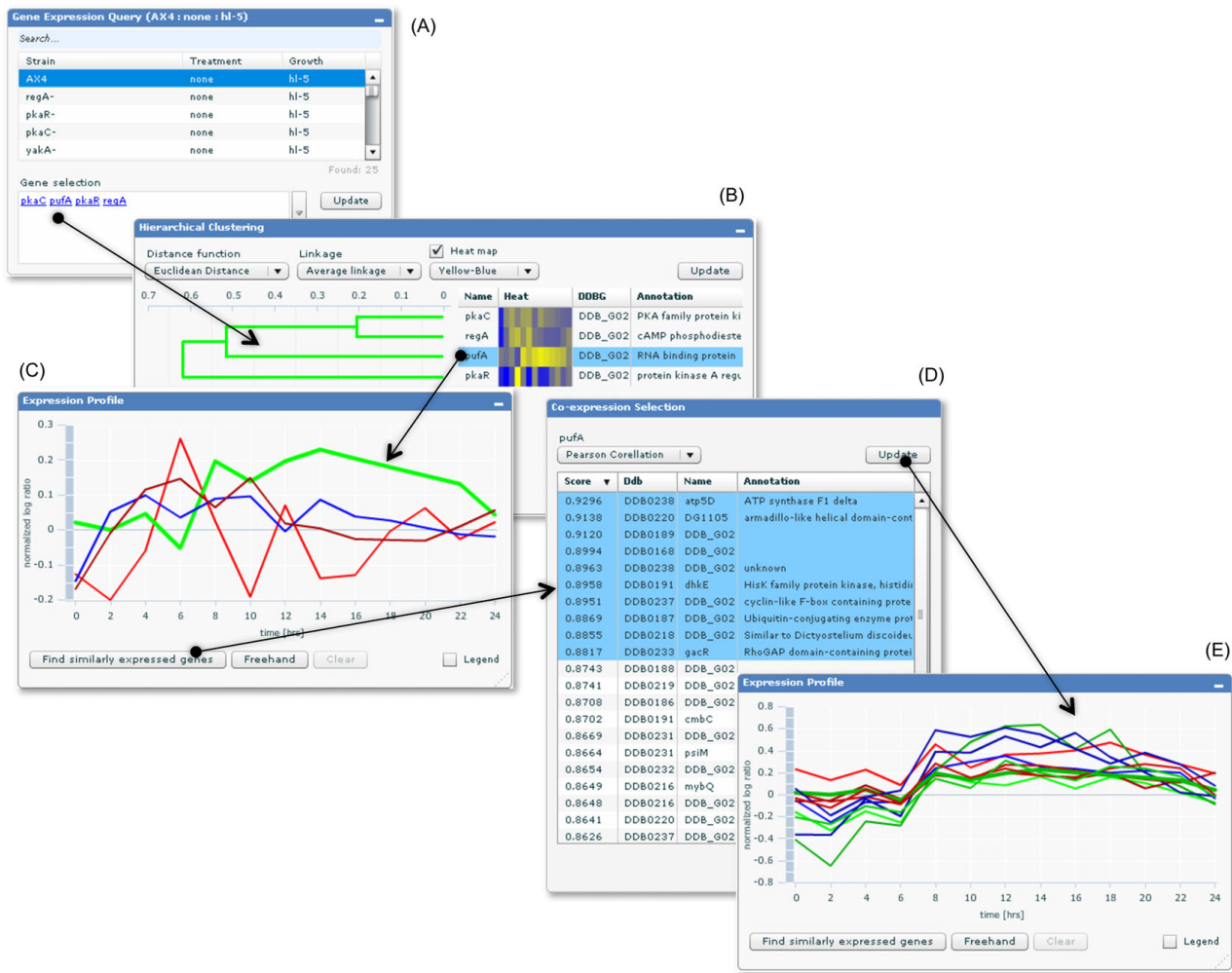
Figure 3 An example of explorative data analysis in dictyExpress. An example of transcriptome exploration steps enabled in dictyExpress. The user starts with a selection of an experiment and a set of genes (A). The user continues by selecting a target gene profile from the dendrogram (the pufA gene) (B). The application automatically highlights the corresponding trajectory in the profile visualization (C). The next step is a request to find and display of list of similarly expressed genes (D). The user can select a subset of the most similar genes, making this list the active set of genes, with a subsequent update of all the dictyExpress components, including the one showing the gene expression profiles (E).

tyExpress from the gene home pages. Following these links, dictyExpress displays the wild-type expression profile for a selected gene, and supports the user for further exploration. The users are able to test the expression of their gene of interest in the wild type and in the mutant strains, and use the application for exploring the Dictyostelium transcriptome, shuttling back and forth to dictyBase in order to explore the annotations of interesting genes.