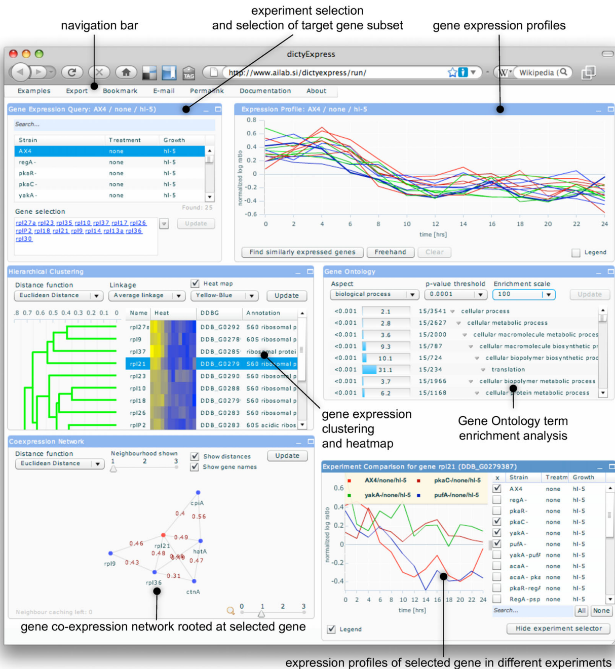
Figure 2 Components of the dictyExpress user interface. The five major components of the dictyExpress graphical interface include experiment and gene selection, display of expression profiles, gene ontology term enrichment analysis, clustering analysis, gene co-expression network, and a display of expression profiles of a selected (target) gene in various experiments. The example shows a group of genes that encode ribosomal proteins. These genes are sharply down-regulated upon starvation of the organism.