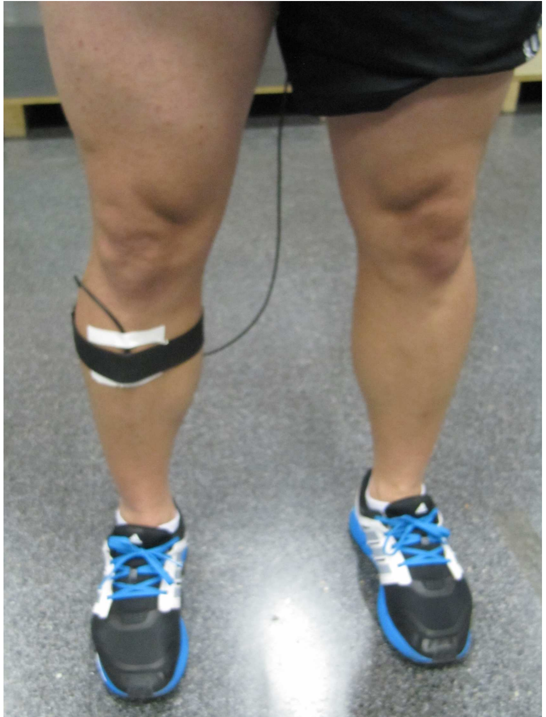
Fig 3. Accelerometer placement on the tibia.