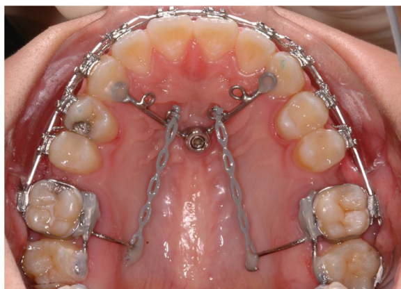
Figure 2 Patient example of a superstructure to mesialize all upper and lower second and third molars.

Skeletal anchorage for orthodontic treatment purposes has been part of many investigations [1,9-11]. Especially torque-resisting TADs (PI and BA) revived interest in [3,5-7,22] and the anterior palate as an insertion site, even for MS [8,12]. About several indications has been reported [7,8,12], in case reports [13,14], in reviews [15,16] or experts opinions [17-21]. But yet, an actual frequency has not been clarified and also not which indications should to be placed. Besides in-vitro or animal-experimental studies, previous investigations reported about a defined sample, but not about the relation of patients treated with skeletal anchorage to the whole patient collective. Therefore no conclusion can