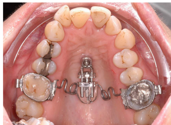
Figure 3 Patient example of a superstructure to distalize the upper lateral teeth ("skeletal supported Pendulum appliance").

be drawn how many patients actually seem to require skeletal anchorage or how many treatment cases with skeletal anchorage were relatively performed. We found that in only 4.2% of all patients treated within the investigated period the indication for skeletal anchorage (PI) was placed. So due to missing data, no comparison to other findings can be made. Considering the amount of required treatment, determining the need to propose skeletal anchorage, it was pointed out that most of the patients (71.4%) were treated in the upper dentition, in 48.2% was the right and left upper side (two quadrants) treated. But 28.6% of the sample was also treated in the mandible (by applying Class II elastics to mesialize lateral teeth in the mandible), meaning treatment in three or four quadrants. This is emphasized by looking at the treatment challenges. We found that two third of the found sample offered malocclusions which required multi-functional treatment purposes; or in other terms, the indication for treating patients skeletally anchored was mostly placed when multi-functional treatment purposes were necessary.