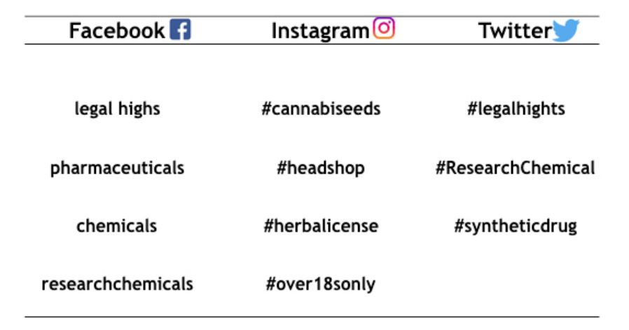
Figure 2. Keywords and hashtags in social networks with explicit content on NPS.

On Twitter, by simply typing #legalhighs, it is possible to buy "the blue stuff", otherwise known as methamphetamine, of the famous Breaking Bad television series as well as other #ResearchChemicals, with free shipping offers and credit/debit card payments accepted. All the users, indeed, can be part of a #highsociety, allowing them to share their #proudstoners daily states of mind. Very recently, epidemiologists and linguistic scientists used Twitter to test the feasibility of producing