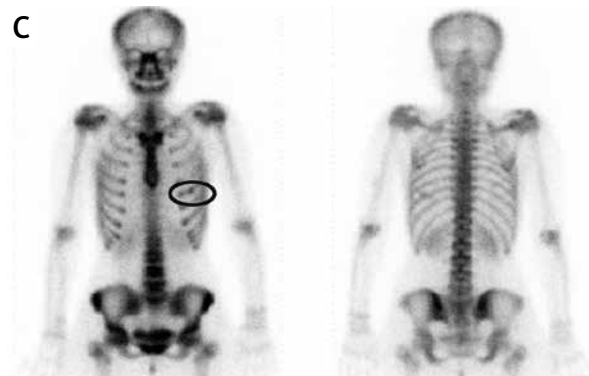
Photo 1. A – Axial plain CT shows bony outgrowth from the posterior cortex of left 5 th rib. B – CT shows 1.8 × 1.7 cm size mass in the right second rib. C – Bone scintigraphy shows increased activity in the left 5 th rib