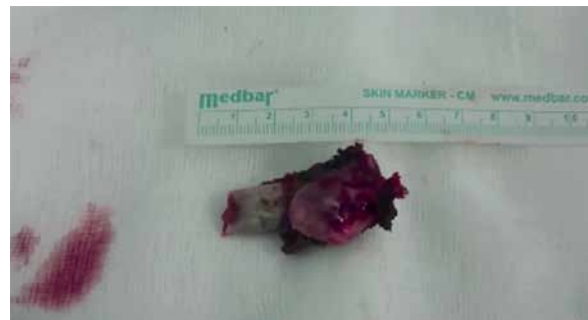
Photo 3. Specimen

The drainage volume and time to chest tube removal were significantly shorter in the VATS group com-