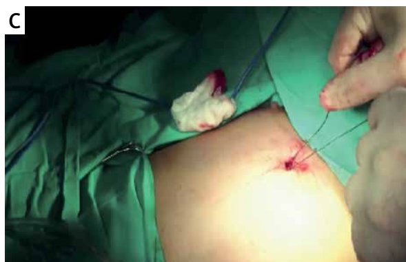
Photo 2. A – Lesion (osteochondroma). B, C – The lower and the upper margin of the rib are looped with a Gigli saw, and the rib is partially resected