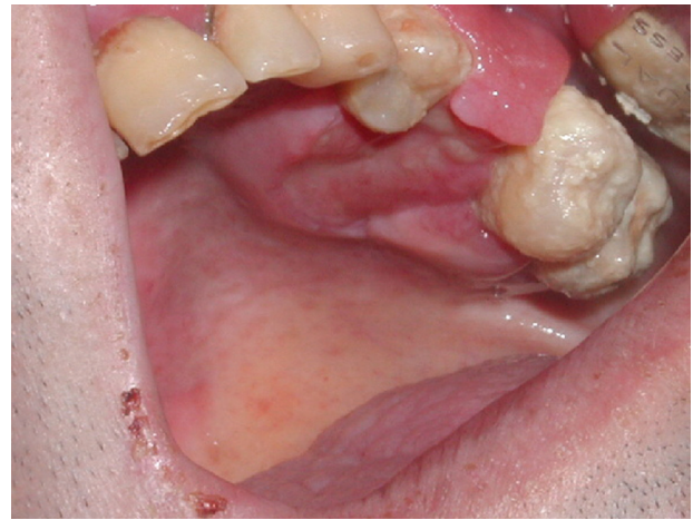
Fig. 2 Ulceration of the gingivae.

and tongue. 25,26 Plasmablastic lymphoma, a B cell lymphoma with a high proportion of plasmablastic lymphocytes, is the most common HIV-associated subtype in this location. 15,27 Constitutional symptoms such as fever and night sweats are frequent in PBL. Its typical appearance is a nonspecific ulceration that spreads rapidly and may eventually lead to hemorrhage, necrosis, and lytic bone destruction. A possible explanation for the high frequency of PBL in lymphoid areas of Waldeyer's ring and in epithelial cells of the cavum and oropharynx is the predilection of EBV to accumulate at these sites 28 (→Fig. 2).