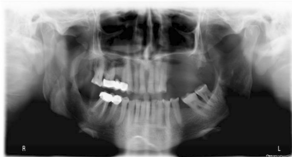
Fig. 4 Wide maxillary lysis in a patient with gingival lymphoma.

is the standard for staging in aggressive lymphomas and HL. PL is performed as part of staging in ARL and is used to identify lymphoma cells and to perform a PCR for EBV.