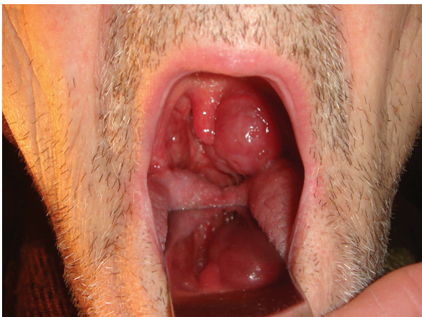
Fig. 1 Unilateral tonsillar hypertrophy in diffuse large B cell lymphoma.

Oral lymphomas occur more frequently in patients with HIV infection. Typical symptoms include oral swelling, pain, and ulcers. These lymphomas may present as a tumor or ulcerated lesion located anywhere in the mouth, but especially the gingivae, palate,