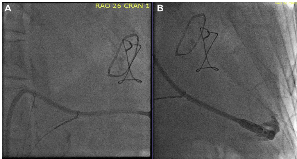
Figure 3 Fluoroscopic right anterior oblique images of the Micra delivery catheter (Medtronic, Minneapolis, MN) and snare apparatus in the heart. A: Traction on the snares alters the shape of the delivery catheter, allowing for a longer reach. B: Contrast injection demonstrating apical septal positioning of the device.