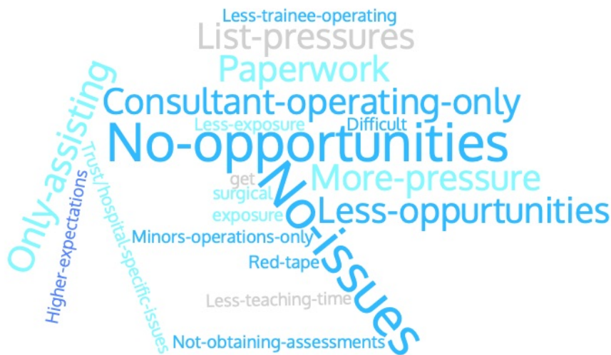
Figure 1: Trainee responses to: "Have you experienced any issues with regards to operating in the independent sector?"

66.1% (39/59) agreed or strongly agreed that their emergency gynaecology surgical training continues to be negatively impacted by COVID-19. 18.64% (11/59) had met their surgical competencies over the past year and 93.22% (55/59) felt their surgical exposure was lower or significantly lower compared to pre-pandemic.