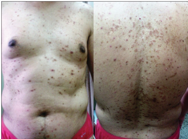
Figure 1: Lichenoid eruption involving the trunk

corticosteroids at a dose of 30 mg/day of prednisolone along with topical corticosteroids (mometasone furoate 0.1% cream twice daily), emollients and oral anti-histamines. Tenofovir was replaced by zidovudine while lamivudine and nevirapine were continued, and the patient was kept under follow-up. After 1-week of cessation of tenofovir and initiation of oral steroids, the lesions had subsided, so the oral steroids were gradually tapered off over the next 3 weeks. At 4 weeks' follow-up, the lesions had cleared completely and only residual hyperpigmentation was left. Re-challenge test was advised but was refused by the patient in view of the generalized nature of eruption.