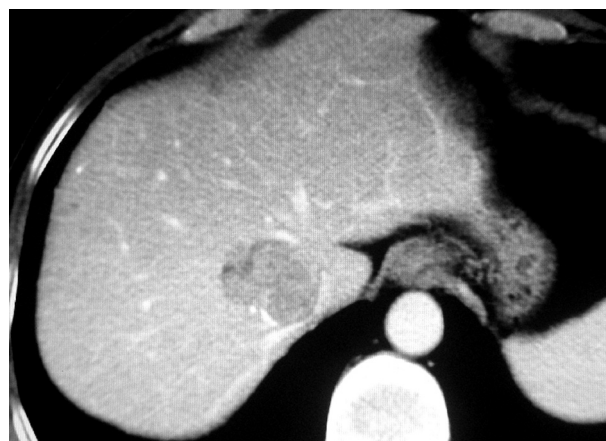
Figure 1. Hepatocellular carcinoma located in dorsal sector of the liver in computed tomography image.

to the tumor stain in the later phase images (Figure 3). The accumulative scores of each hepatic artery of eleven patients were used to evaluate the blood supply of feeding arteries to the tumors. Cases were excluded from the study if they had one or more of the followings: (a) liver with irregular outward appearance, eg, severe cirrhosis; (b) arterio-portal fistula; (c) arterio-venous fistula; (d) abnormal anastomotic or collateral arteries between left and right hepatic arteries; (e) a history of abdominal surgery before interventional procedure; (f) diffuse tumors in liver. The SPSS 11.0 (SPSS Inc, Chicago, Illinois, USA) was used for statistical analysis. The case numbers of the feeding arteries of the tumors were compared by Cochran's Q test. The scores of feeding arteries of the tumors were compared by test for several related samples (Friedman) and test for two related samples (Wilcoxon). P values < 0.05 were considered statistically significant.