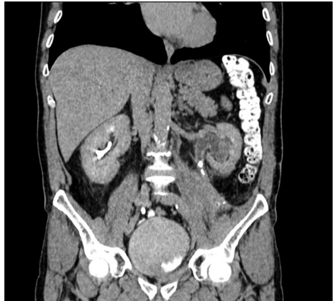
Figure 3. A postoperative CT scan (delayed phase).