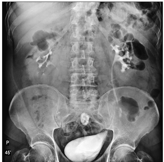
Figure 4. A postoperative intravenous urography scan.