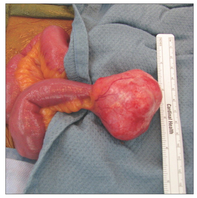
Figure 2: Intraoperative photograph shows a pedunculated mass on the small bowel mesentery

CFT is a rare, usually solitary, benign tumor of uncertain etiology. The most common sites are the soft tissues of the extremities, pleura, or peritoneum.<sup>[1-3]</sup> Involvement of the gastrointestinal (GI) tract is rare. About 30 cases of abdominal CFTs have been reported to date.<sup>[3]</sup> For abdominal CFTs the mean patient age is 34 years compared with 16 years for patients with CFTs occurring in the superficial soft tissues.<sup>[3]</sup> CFTs have characteristic histologic features